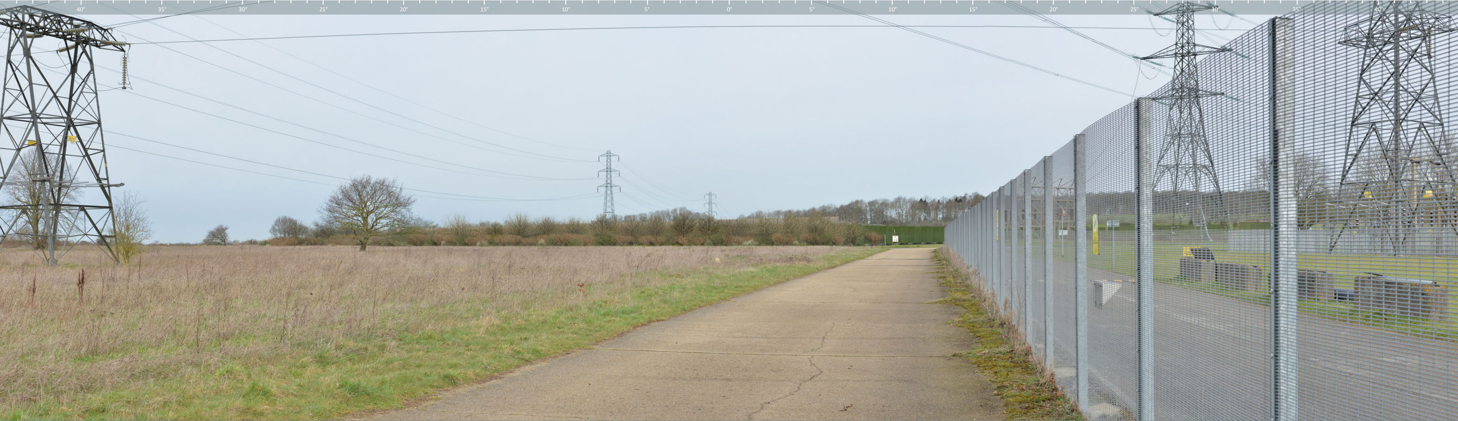
Proposed View Year 10

Please note: To view this image digitally, calibrate the scale bar on the right side of the page for a correct scale representation, view the printed A1 sheet at a comfortable arm's length