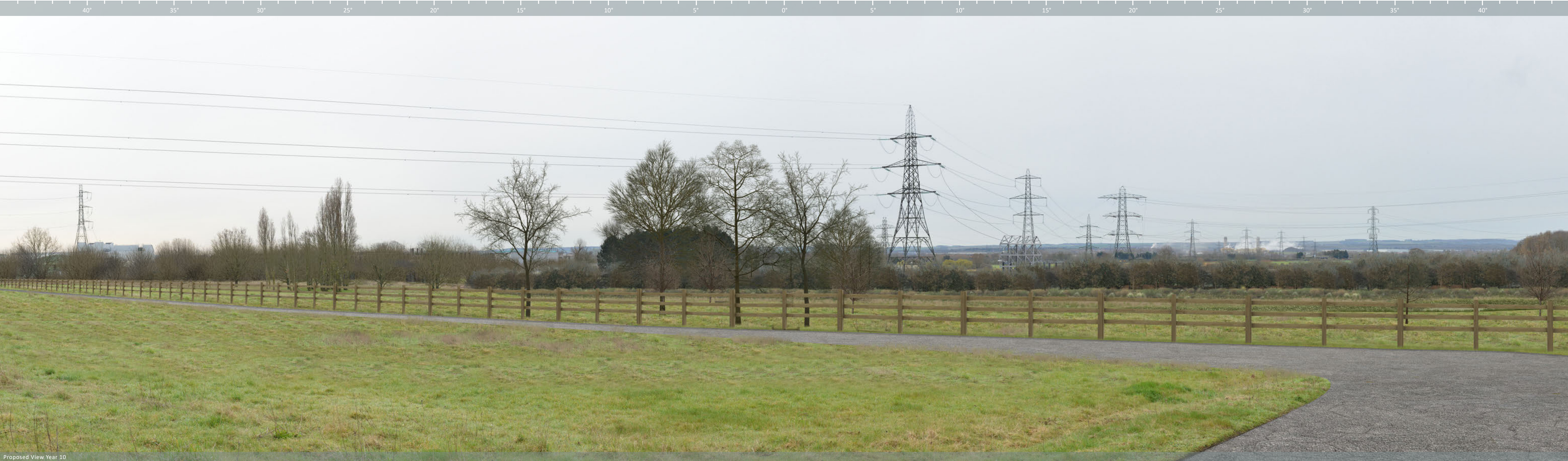
Proposed View Year 10

Please note: To view this image digitally, calibrate the scale bar on the right side of the page for a correct scale representation, view the printed A1 sheet at a comfortable arm's length