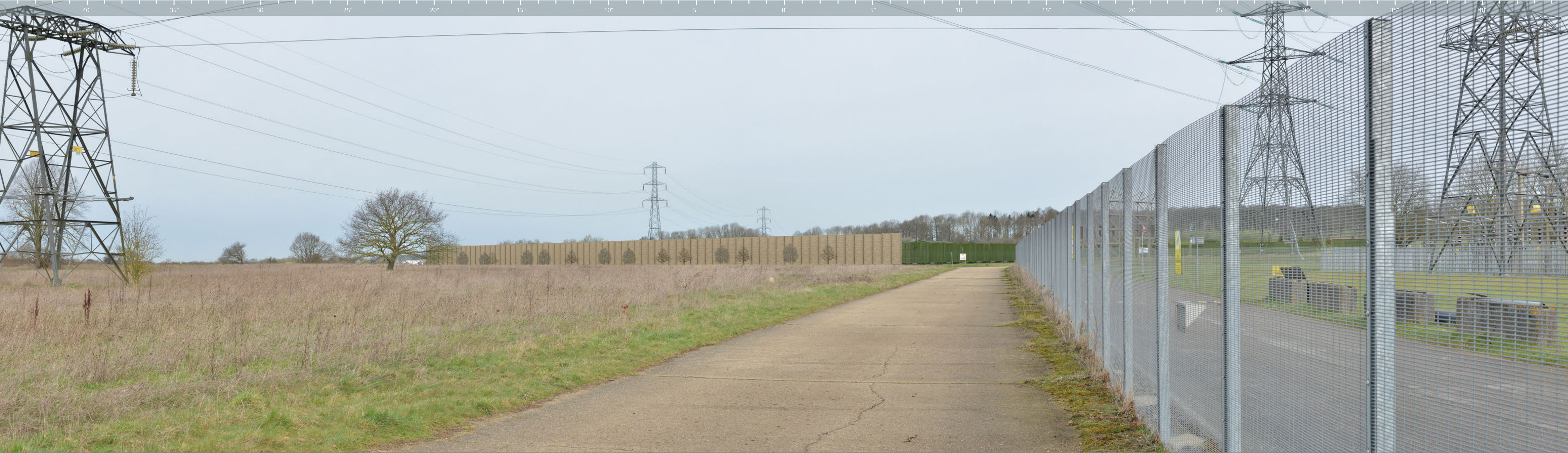
Proposed View Year 1

Please note: To view this image digitally, calibrate the scale bar on the right side of the page for a correct scale representation, view the printed A1 sheet at a comfortable arm's length