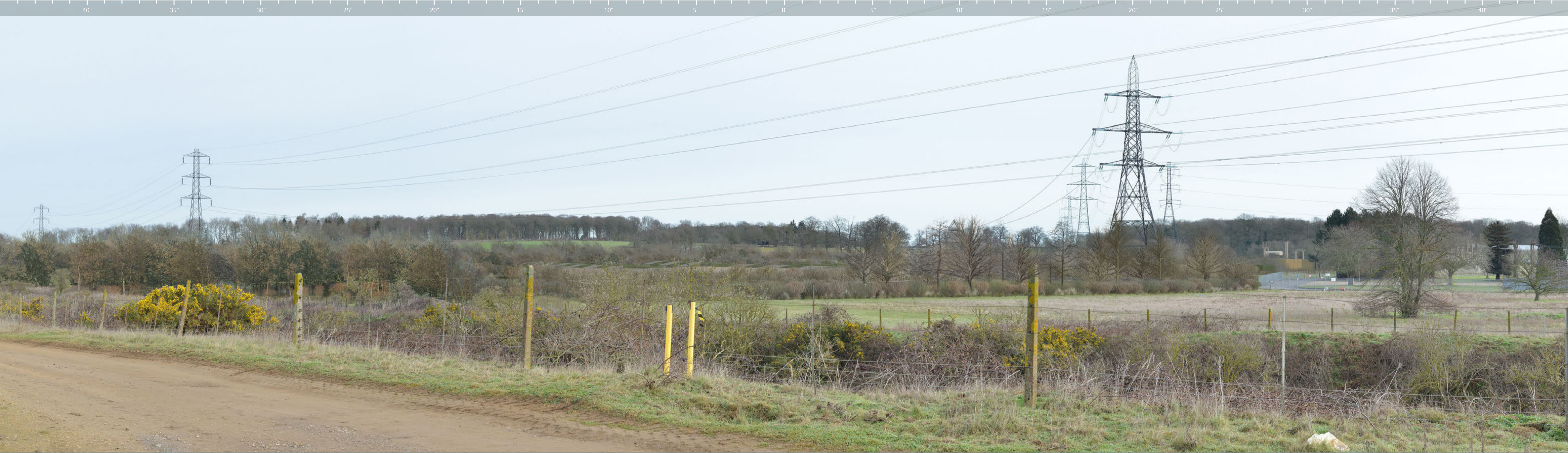
Proposed view showing established tree planting (10+ years)

Please note: To view this image digitally, calibrate the scale bar on the right side of the page for a correct scale representation, view the printed A1 sheet at a comfortable arm's length