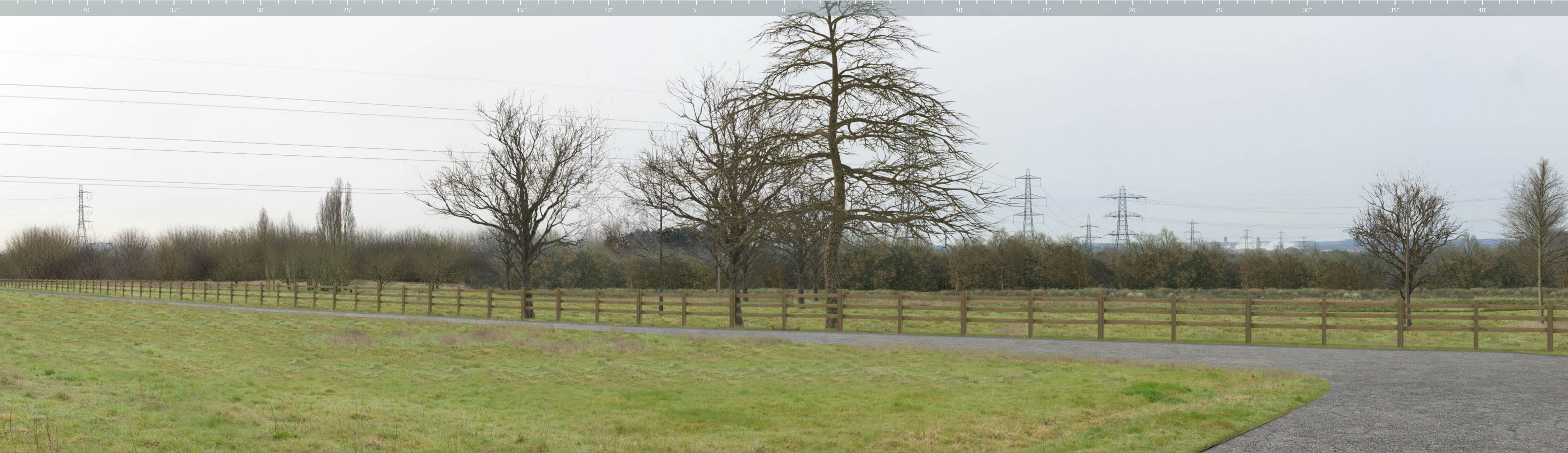
Proposed view showing established tree planting (10+ years)

Please note: To view this image digitally, calibrate the scale bar on the right side of the page for a correct scale representation, view the printed A1 sheet at a comfortable arm's length