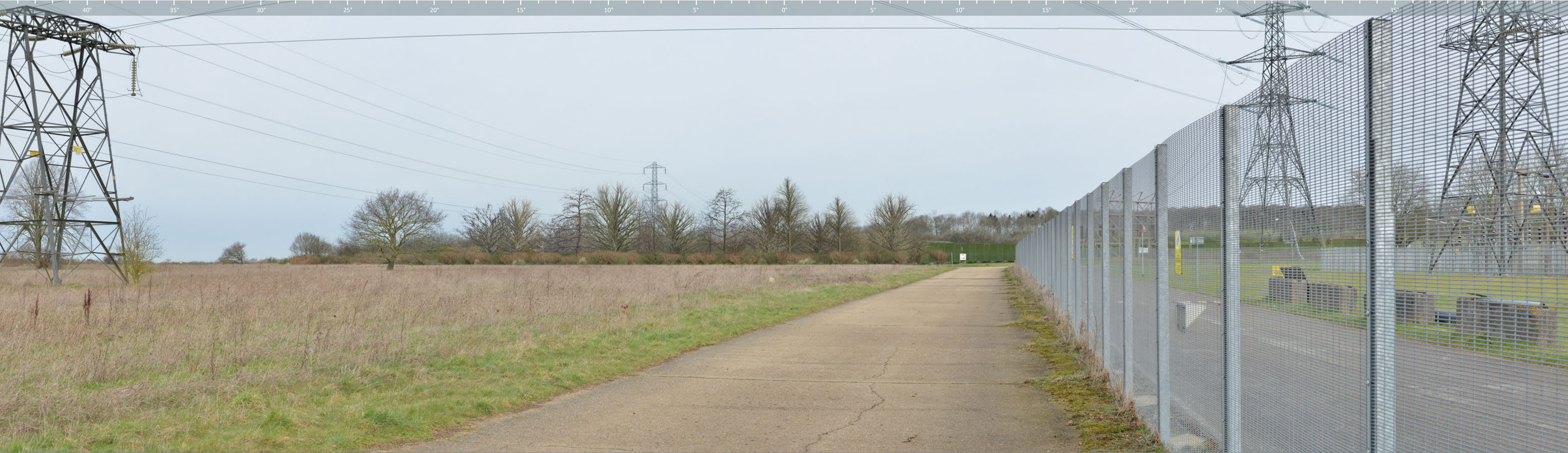
Proposed view showing established tree planting (10+ years)

Please note: To view this image digitally, calibrate the scale bar on the right side of the page for a correct scale representation, view the printed A1 sheet at a comfortable arm's length