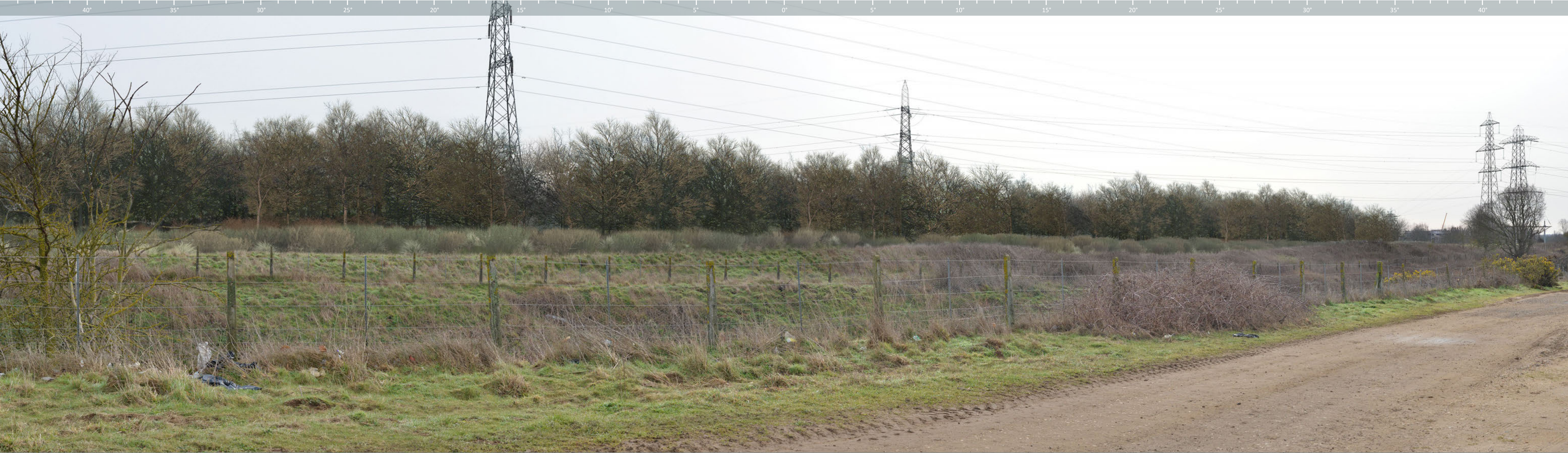
Proposed view showing established tree planting (10+ years)

Please note: To view this image digitally, calibrate the scale bar on the right side of the page for a correct scale representation, view the printed A1 sheet at a comfortable arm's length