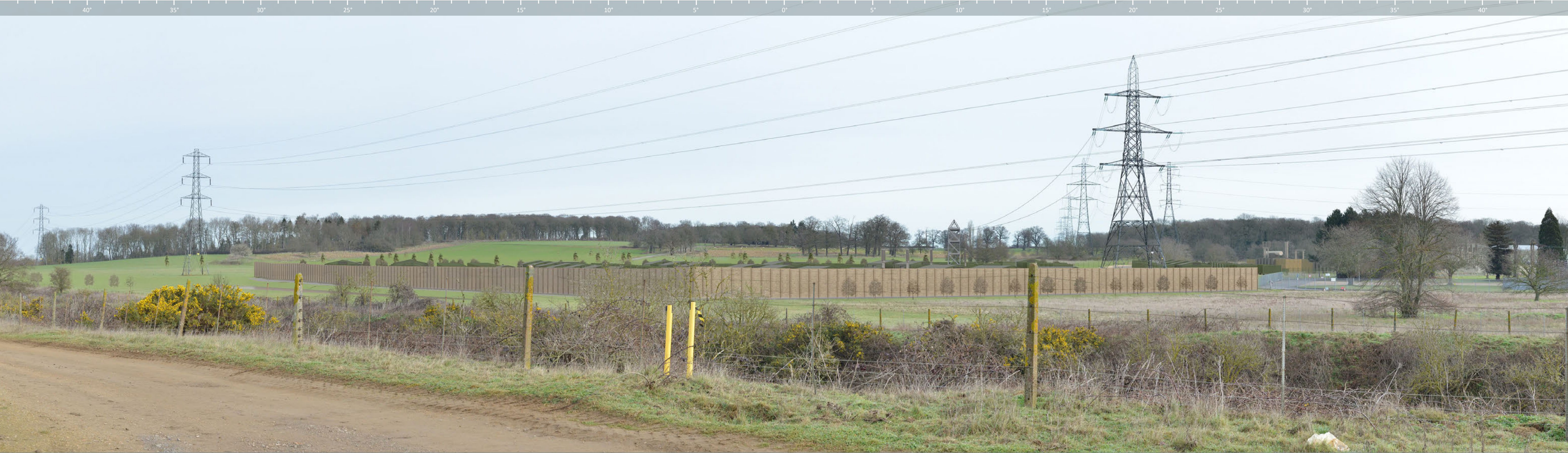
Proposed View Year 1

Please note: To view this image digitally, calibrate the scale bar on the right side of the page for a correct scale representation, view the printed A1 sheet at a comfortable arm's length