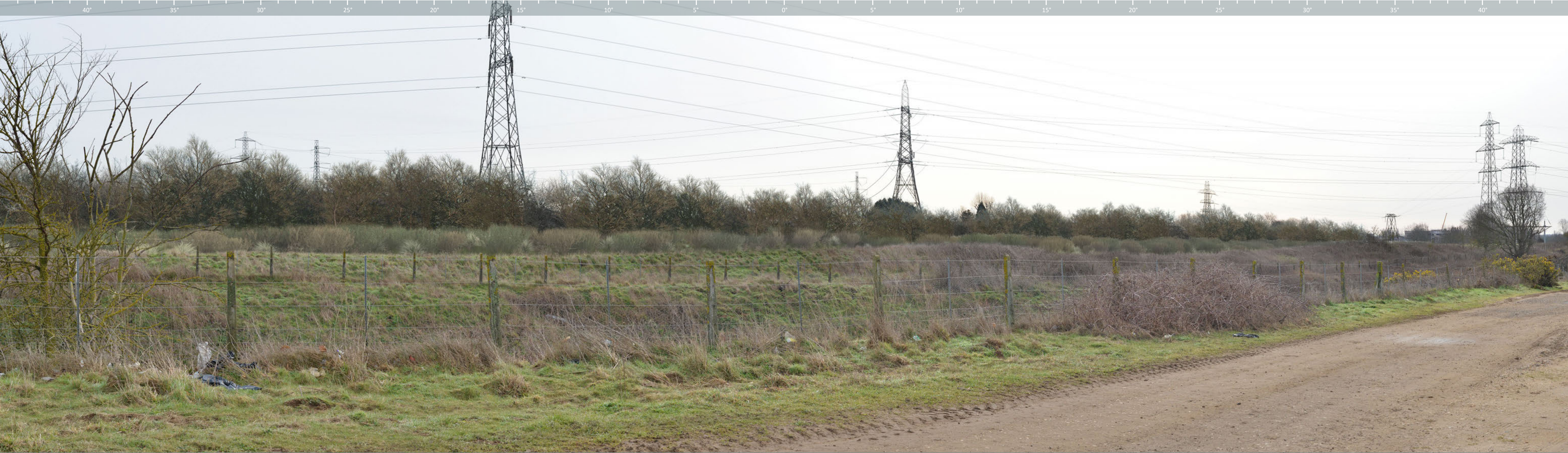
Proposed View Year 10

Please note: To view this image digitally, calibrate the scale bar on the right side of the page for a correct scale representation, view the printed A1 sheet at a comfortable arm's length