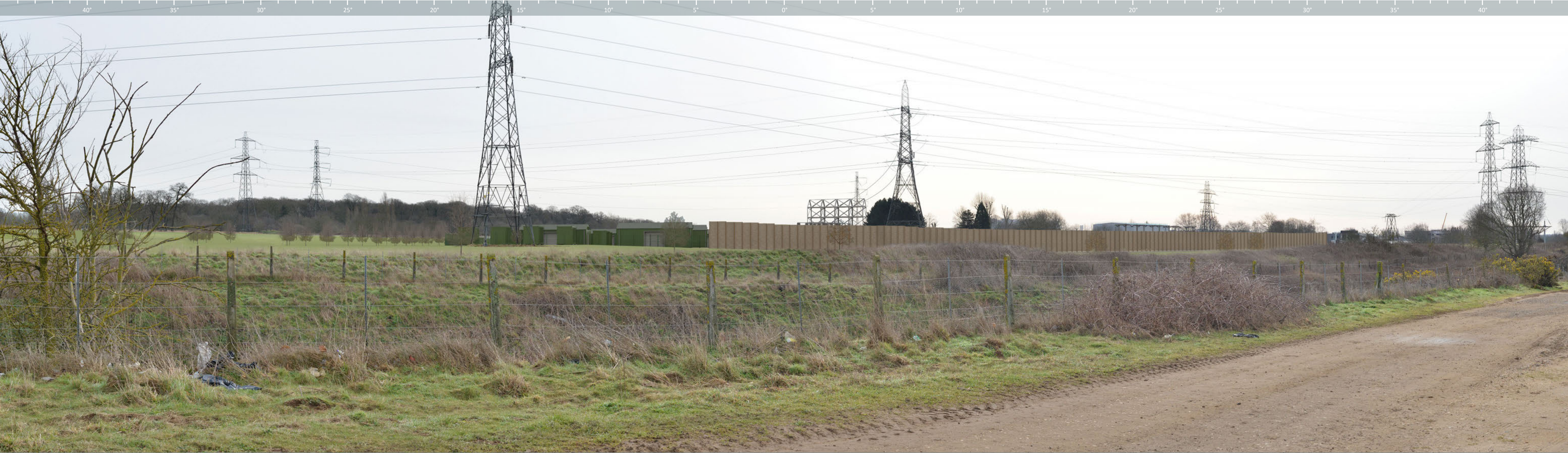
Proposed View Year 1

Please note: To view this image digitally, calibrate the scale bar on the right side of the page for a correct scale representation, view the printed A1 sheet at a comfortable arm's length