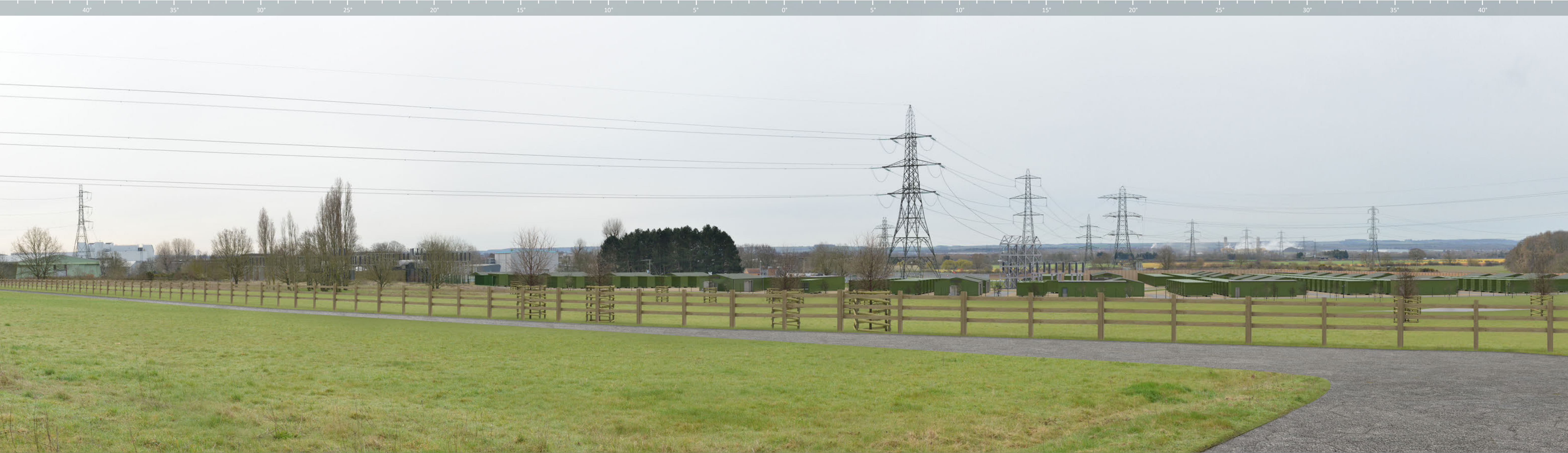
Proposed View Year 1

Please note: To view this image digitally, calibrate the scale bar on the right side of the page for a correct scale representation, view the printed A1 sheet at a comfortable arm's length