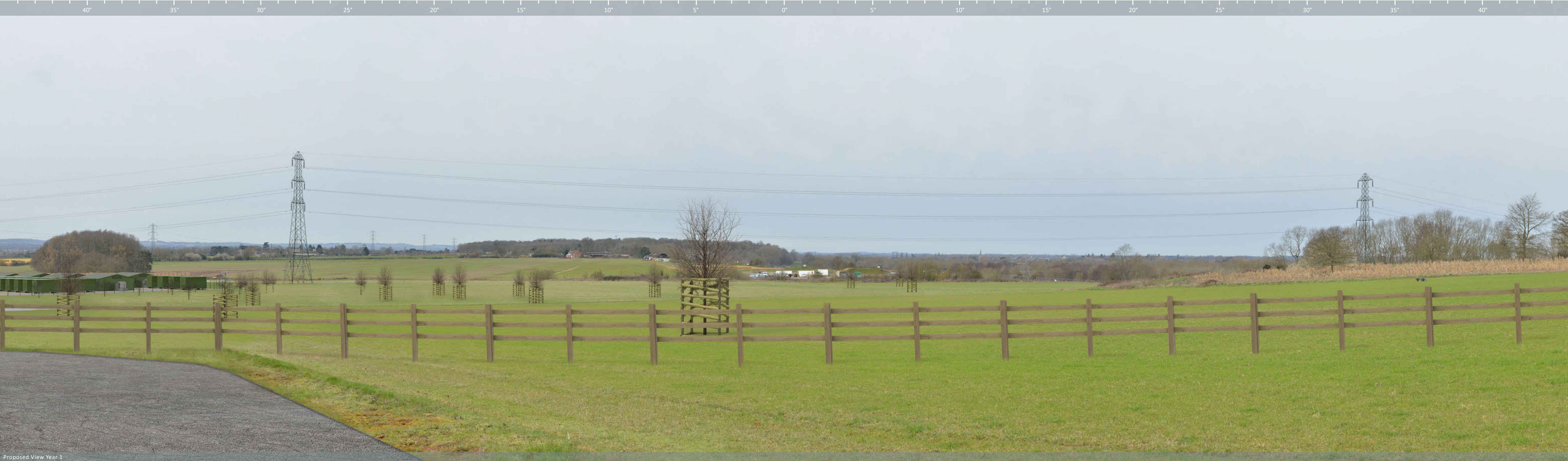
Proposed View Year 1

Please note: To view this image digitally, calibrate the scale bar on the right side of the page for a correct scale representation, view the printed A1 sheet at a comfortable arm's length