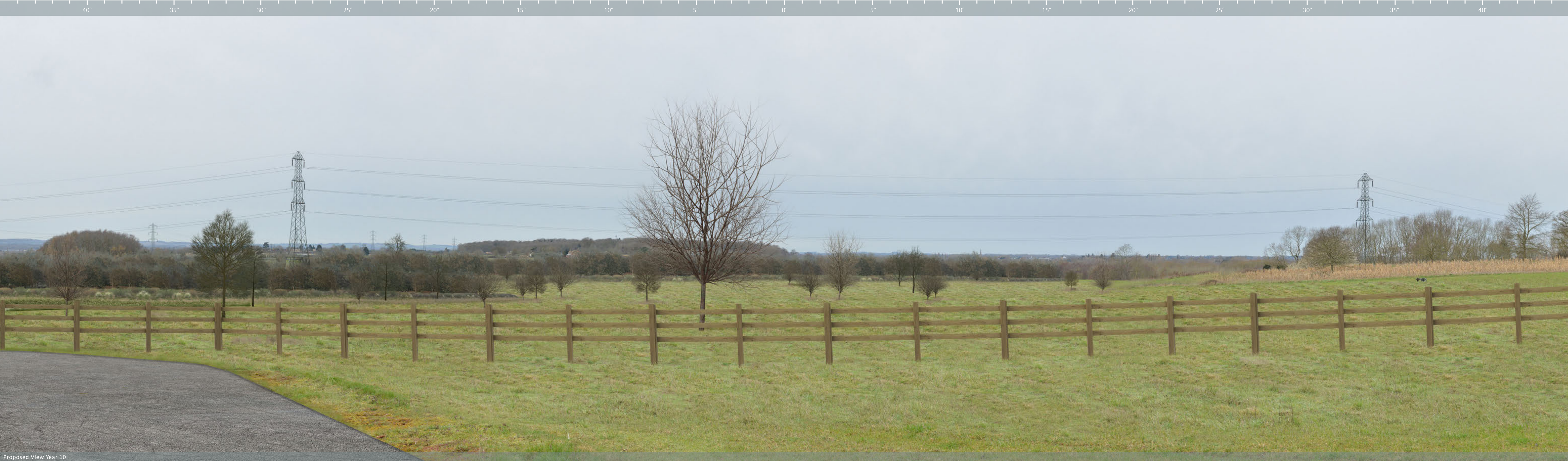
Proposed View Year 10

Please note: To view this image digitally, calibrate the scale bar on the right side of the page for a correct scale representation, view the printed A1 sheet at a comfortable arm's length