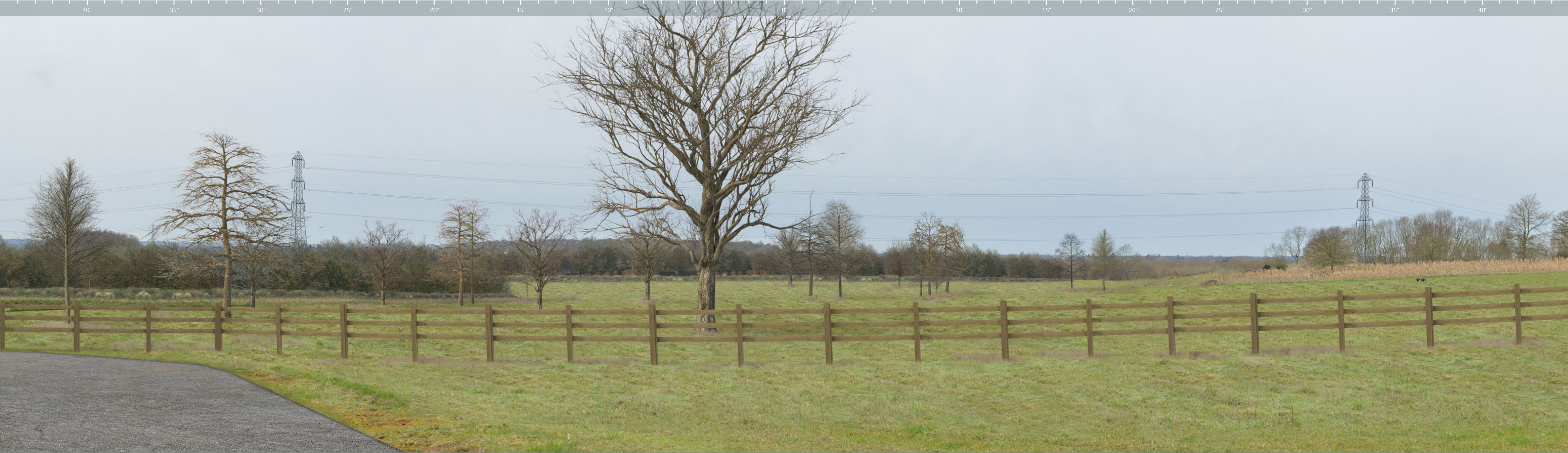
Proposed view showing established tree planting (10+ years)

Please note: To view this image digitally, calibrate the scale bar on the right side of the page for a correct scale representation, view the printed A1 sheet at a comfortable arm's length