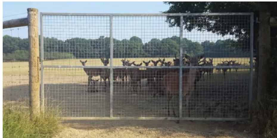
3m wide galvanised steel vehicle access gate