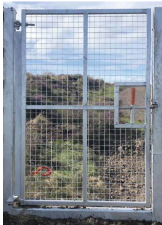
1.5m wide, galvanised steel self closing pedestrian gate