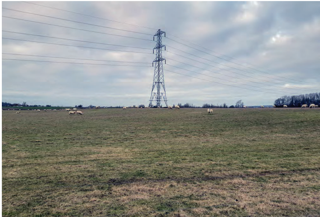
Plate 6: View towards northeast focusing on potential earthwork