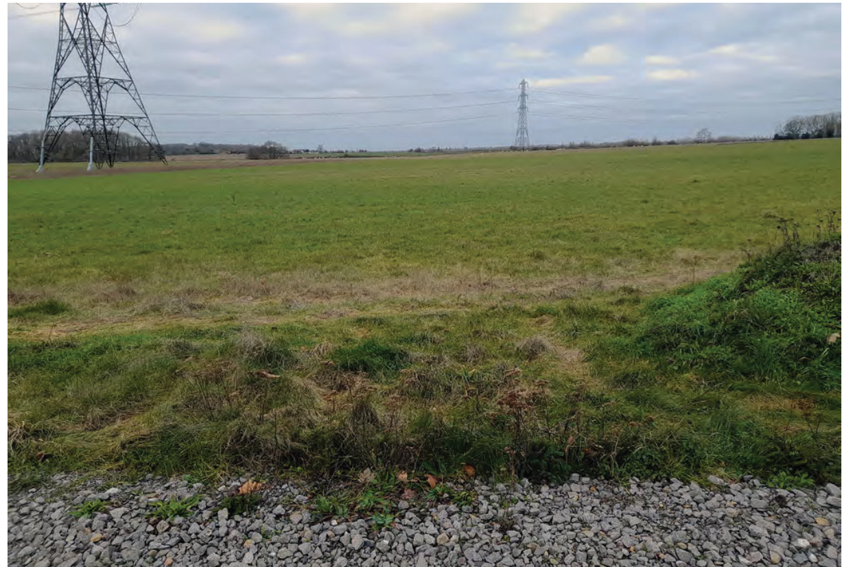
Plate 8: View across the eastern part of the site