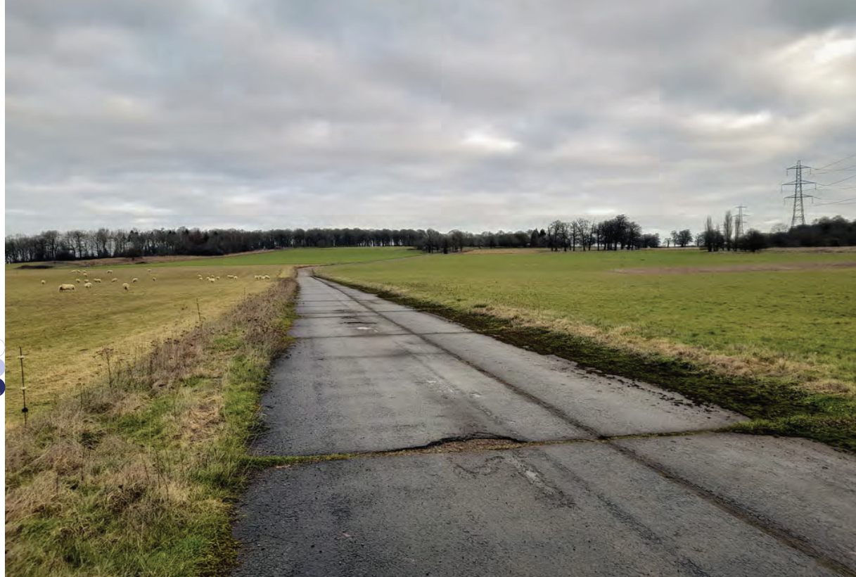
Plate 5: View of site looking across towards north and Nuneham Courtenay Registered Park and Garden and Conservation Area