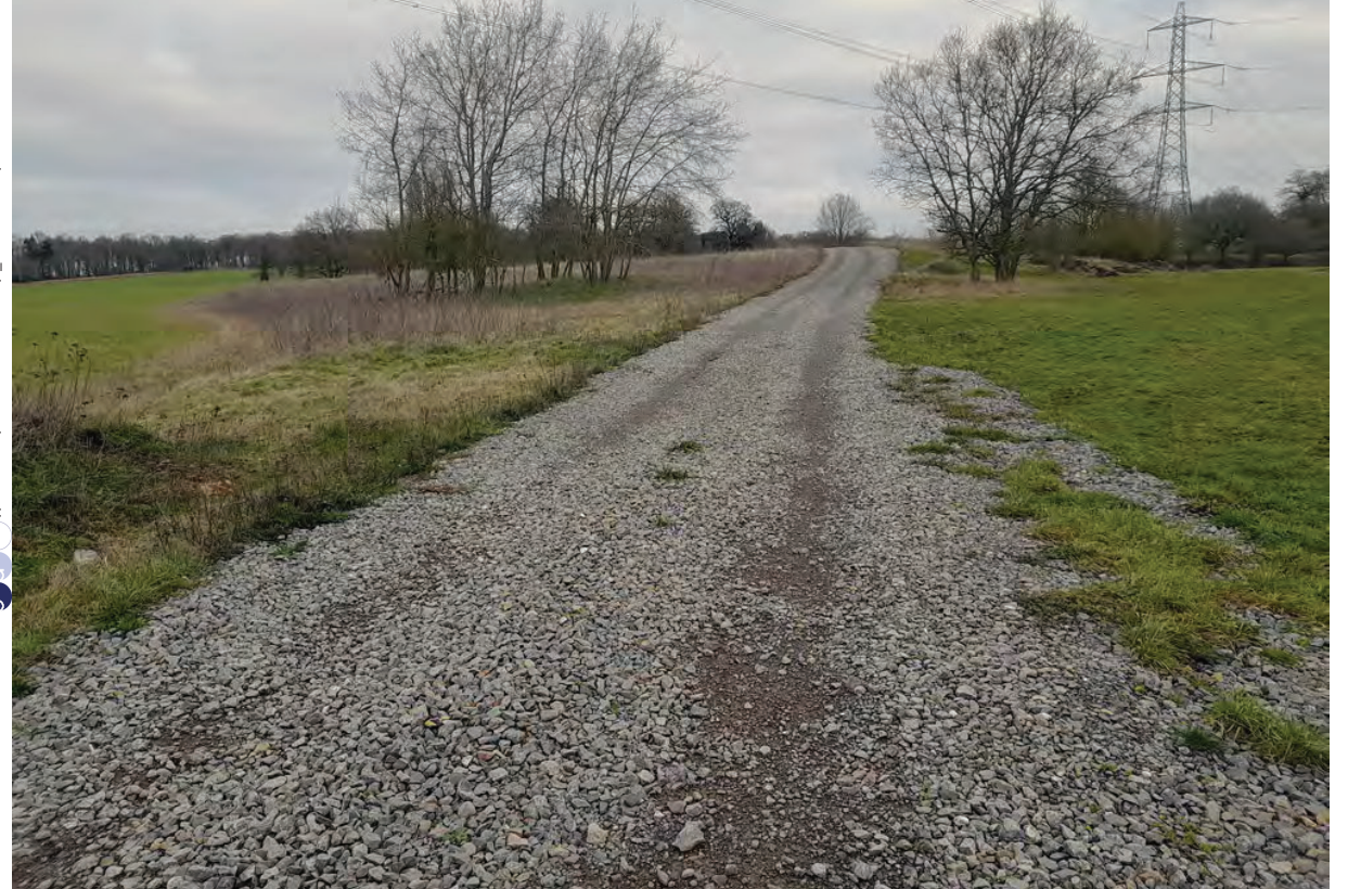
Plate 7: View towards northeast across eastern part of site towards Nuneham Courtenay Registered Park and Garden