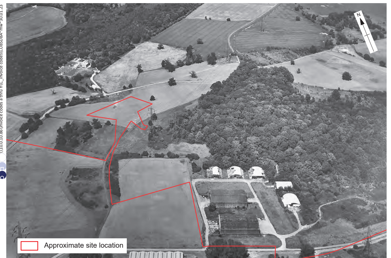
Plate 11: Extract of Aerial Photograph Ref. SU5396/5 (2000)