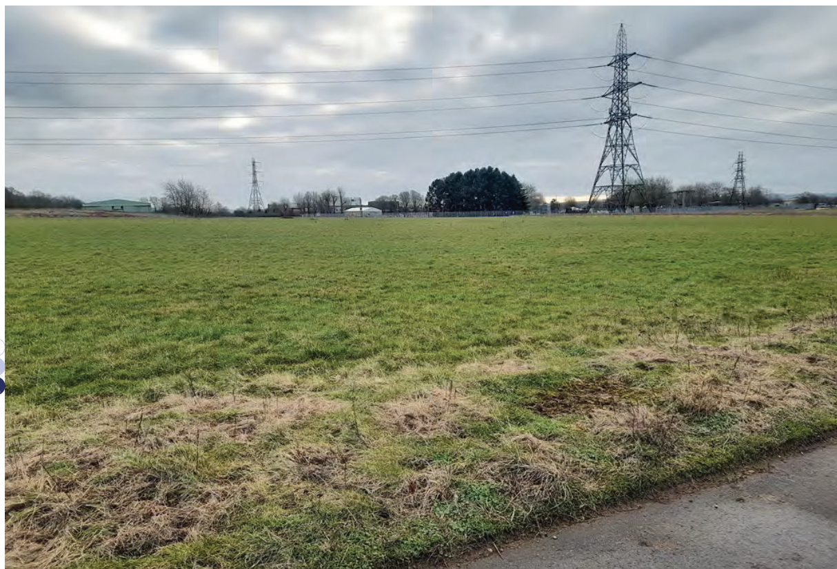
Plate 13: View from Nuneham Courtenay Registered Park and Garden looking across the site towards southeast and the Culham Science Centre