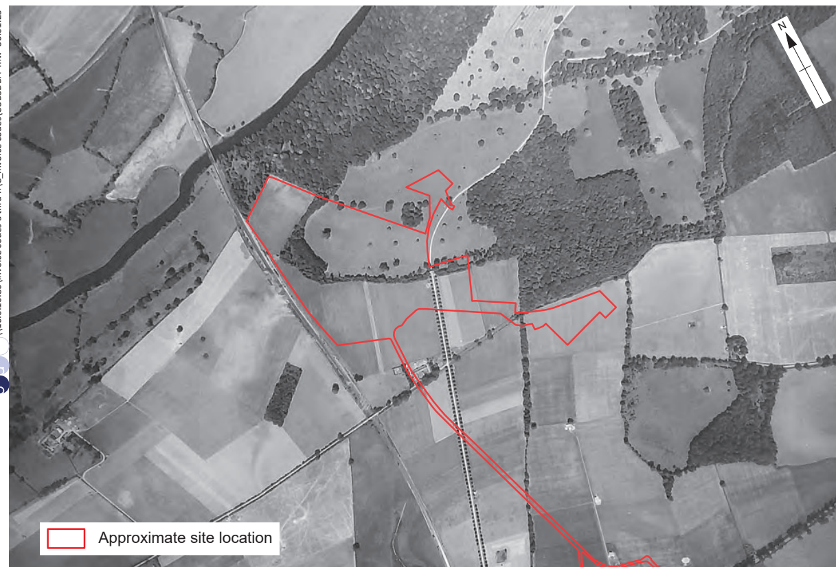
Plate 9: Extract of Aerial Photograph Ref. US/13PH/581 (June 1943)