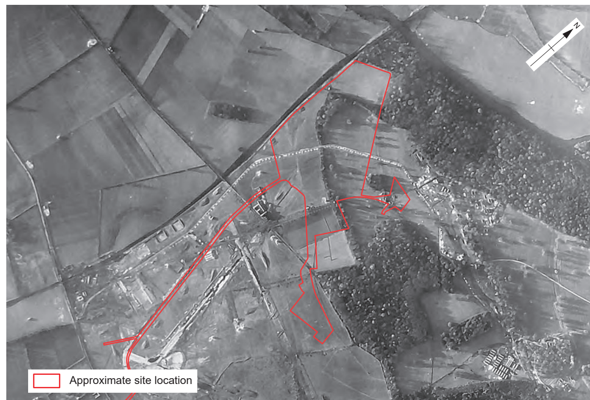
Plate 10: Extract of Aerial Photograph Ref. US/7PH/GP/LOC107 (December 1943) as held by Historic England at Swindon Archive